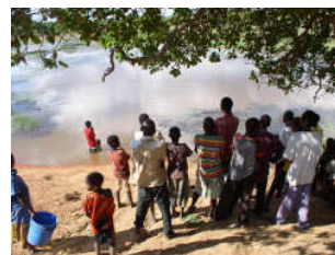
Watching a baptism at the Mesa dam