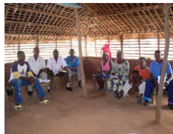
Brothers and Sisters at the Church in Nanhupo