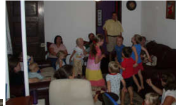
The kids enjoy singing children's songs during team worship