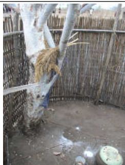
A Tree Used to Worship Spirits