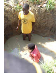
A New Brother is Baptized into Christ in Nanhupo