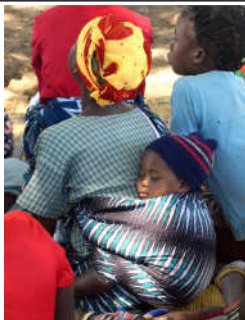
A baby sleeping while Mom listens to a sermon