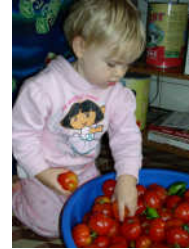
Maggie helps Mommy with the 100 lbs. of tomatoes