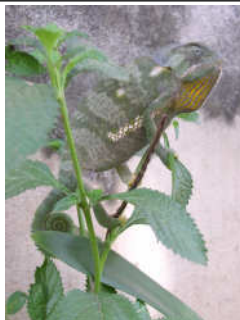
A Chameleon Visits us in our Front Yard

people were just taking advantage of the others and not willing to give anything themselves. I felt encouraged to see some new Christians making sacrifices and discouraged to see more "mature" Christians who were not willing to contribute. Although some good came out of the conference, it was difficult for me to see past the problems.