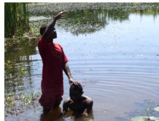
Baptizing a new believer from Marimano