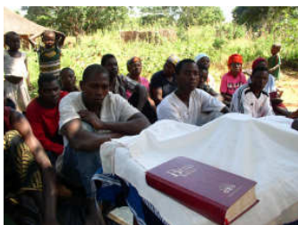
The first worship service in Marimano