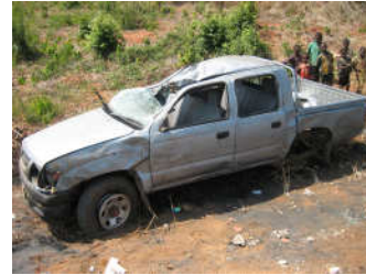
Our car after the accident