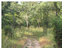
The game park we went to. Can you see the animals? Neither did we.

park. It was refreshing to be out in the beautiful African countryside, even if we did have to fight off clouds of Tsetse flies. One of our most frequent activities has been language class. The five of us interns have discovered the struggles of learning an African language. It has been really great to see how a team on the mission field works together, and responds to the needs of the Churches and Christians here. Please continue to pray for us