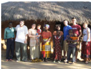
Interns visiting a Mozambican friend

We have been able to see much of what the Makua team is doing here. They have not tried to create any false atmosphere of what life is like, allowing us to experience all of their team meetings and interact with the people with whom they interact. One highlight of our stay was going to a nearby game