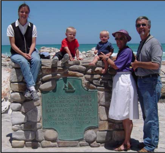
Southern most point of Africa