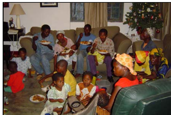
Our workers and their families eating rice and goat in our home.

things. We were reminded that while we were trying hard to have a full-blown Christmas meal complete with junk food and presents, people around us were going hungry, since this is also the season of hunger. We did enjoy having a party for our workers and their families. We ate rice and goat curry with sodas and watched "The Gods Must be Crazy". We enjoyed celebrating with them and having them in our home.