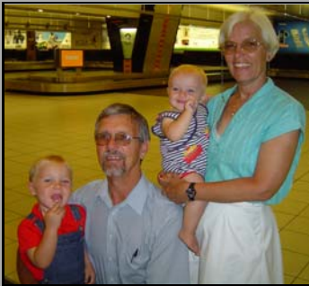
Papaw and Grandma

Although there are so many differences in how we celebrate Christmas here, we try hard to keep our traditions alive. We set up our Christmas tree, put Santa and snowmen all over the house (they melted ☺), hung stockings, had Christmas music, opened presents and of course made and ate lots of junk food. We did the best we could to have a traditional Christmas meal with turkey legs, cranberry sauce, homemade stuffing, mashed potatoes, and apple pie.