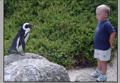
Don't touch the penguins — they bite!!!