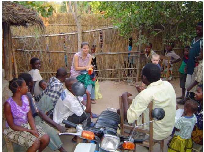
Out practicing Makua-Metto

I have to admit that learning language is not all fun and games. Many a day we have had to drag ourselves to class and out to practice with people. There have been times of frustration as we long to say so much more than we can. It will be wonderful one day to be able speak fluently with these people. We pray often for perseverance, understanding, and joy as we go through this daily process.