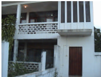
Our apartment, 2 nd floor

We moved in to a 3 bedroom, one bath, second floor apartment in Montepuez. We have fairly continual electricity, unlike some parts of the city. We can have running water if we go down stairs and turn on the pump, but we can't have it on all of the time, so we bucket flush the toilets and use the pump only to take a shower. The apartment is very comfortable and we are thankful for it. The apartment also came with a guard at night and worker during the day. You are expected to have a worker and guard here, both for your own security, and to help people here out by providing Jobs. Our day worker cooks for us about 2-3 times a week, which has been a good experience. Her specialties are coconut chicken with rice and grilled chicken with garlic and lemon (from the lemon tree in the back yard!), and curried goat. She cooks in the back yard with a coal stove and it has been very interesting learn how she does all of that.